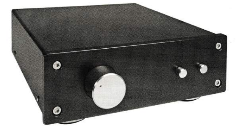
The power supply speed adjustment control was uncalibrated making a stroboscope essential for setting speed accurately to 33 or 45 rpm. Adjustment range measured +10% to -6%.

Our sample had a lovely SME V magnesium arm fitted, complete with Ortofon Cadenza Bronze MC cartridge. I connected the arm's leads to an Icon Audio PS3 phono stage and thence to Quad II-eighty valve amplifiers (80W) driving Spendor SP200 loudspeakers, on review for next month's issue. This then is an arch-analogue system with nary a